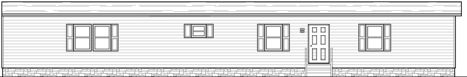
FRONT SIDE ELEVATION

1140 SQ.FT. (STD PLAN "CONDITIONED") N/A SQ.FT. (W/OPT. PORCH/RECESS "CONDITIONED")