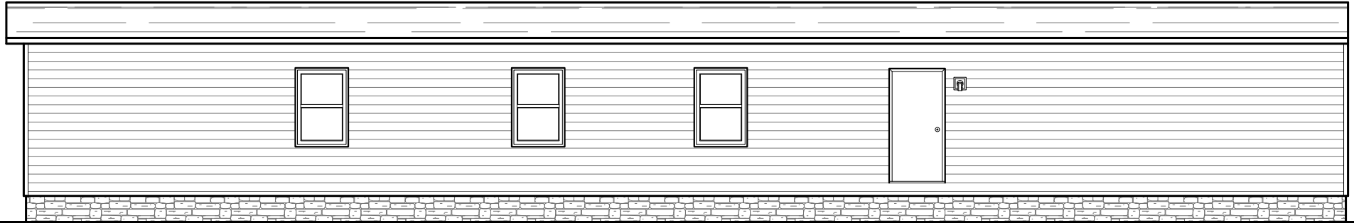
REAR SIDE ELEVATION