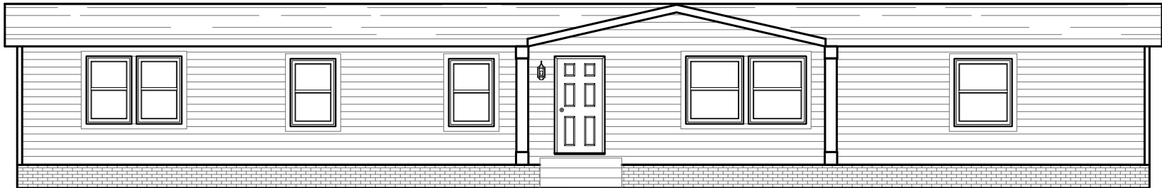
BREEZE II ELEVATION

2001 SQ.FT. (STD PLAN "CONDITIONED") SQ.FT. (W/OPT. PORCH/RECESS "CONDITIONED")